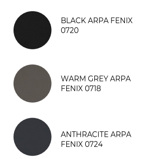
Table top finishes